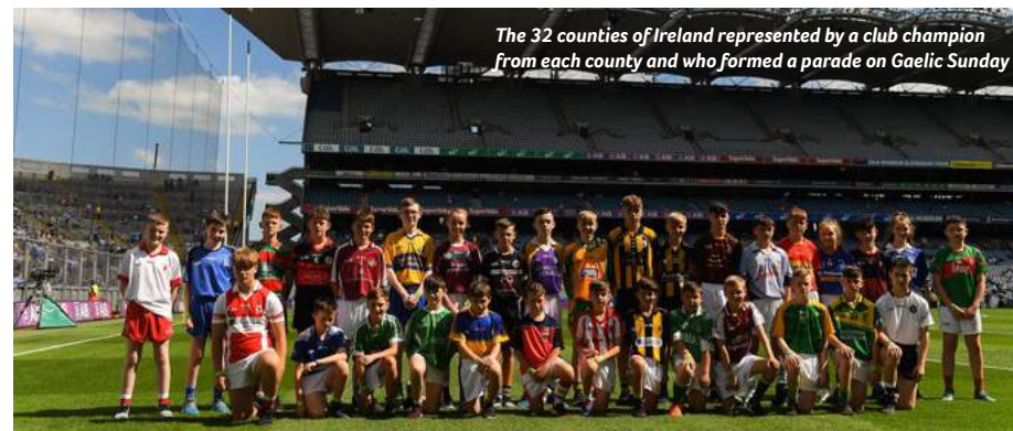
The 32 counties of Ireland represented by a club champion from each county and who formed a parade on Gaelic Sunday