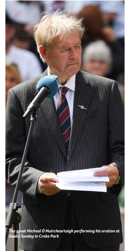
The great Micheal Ó Muircheartaigh performing his oration at Gaelic Sunday in Croke Park