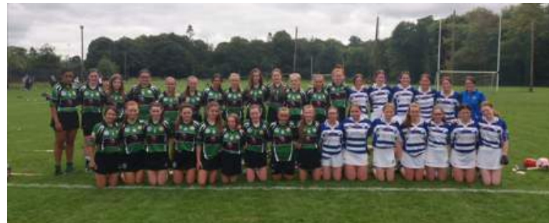
Camogie players from Erins Isle GAA Club in Dublin and Naas in Kildare who played in Erins Isle on Gaelic Sunday

Here they had matches for their u6s to u14s, who mixed in with our adult players- they had a ball playing hurling with their adult heroes.