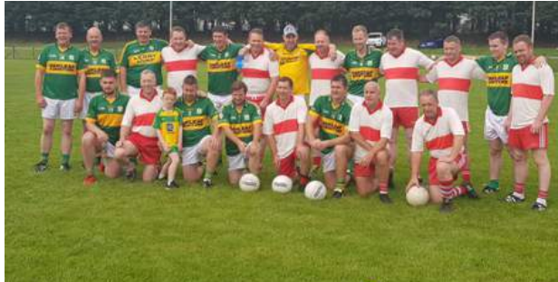
In Derry, directly after Drumsurn and Ballymaguigan finished their league game, there was an over 35 game took place between both clubs to mark Gaelic Sunday