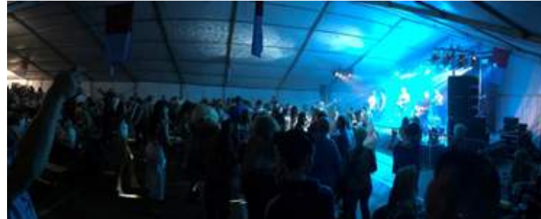
Glack GAA in Derry had a packed day and held a Cúl Camp, family fun day and a music festival to coincide with Gaelic Sunday.