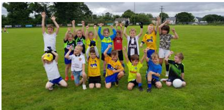
In Roscommon St Ronan's GAA held a day for juveniles and their families