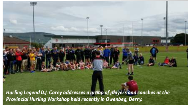
Hurling Legend D.J. Carey addresses a group of players and coaches at the Provincial Hurling Workshop held recently in Owenbeg, Derry.

An indication of the enthusiasm on the day by coaches and attendees was that when the final whistle was blown at 2.30p.m. it took a further 30 minutes to get them all in for lunch!