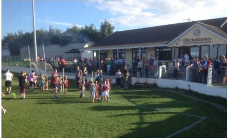
Dicksboro in Kilkenny played in the original Gaelic Sunday in 1918. This year they held a bar b q to mark the end of their successful summer camp and Gaelic Sunday weekend featuring 235 children