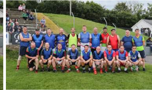
Lisnaskea Emmets in Fermanagh held what they called 'Old Crocks' matches to mark the occasion