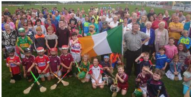
In Cork, Meelin GAA staged a parade of 250 club members from our Village to the GAA Grounds.